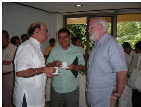
Lifetime members taking a break before the meeting