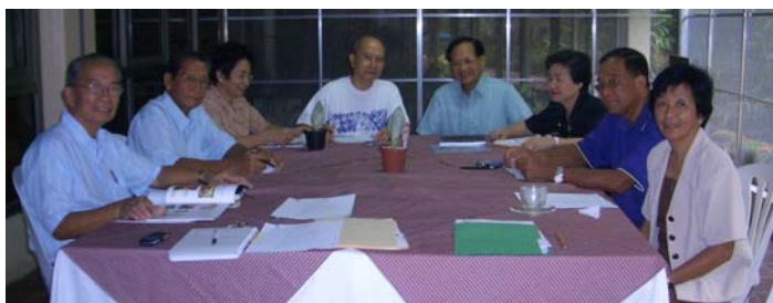
ARF Working Group during its meeting in November 2005.

The ARF Working Group is an informal group of experts and interested parties that come together to help develop projects/activities of ARF in the Philippines and to help in the implementation. We are inviting all ARF Lifetime Members, particularly those in the Philippines, to join the Working Group and to participate at their meetings. Please inform us of your interest so that we can inform you of the venue and agenda of each WG meeting.