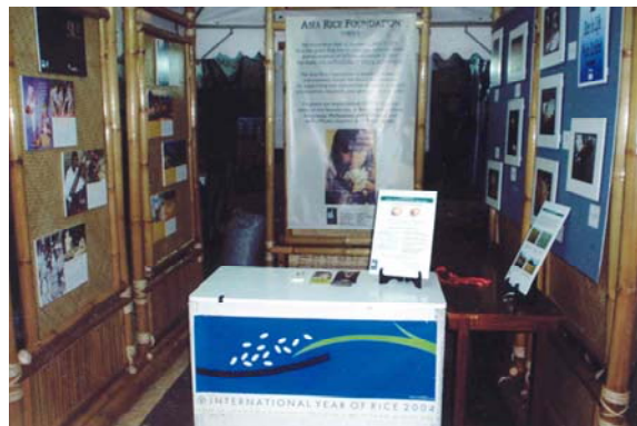
ARF's booth whose top 30 photos from the Rice is Life Photo Contest were exhibited and the newly released book “Rice in the Seven Arts” was displayed.

government units, staff from state colleges and universities, government officials and diplomatic corps.