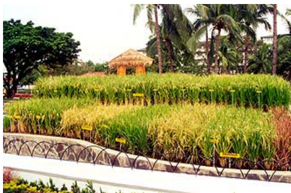
Rice Garden at Luneta Park.