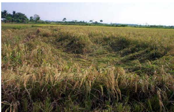
Lodging in Sampaguita monoculture plot. No lodging was observed in plots planted to mixtures of Sampaguita and PSBRc30, 2004 WS, Munoz, Nueva Ecija.

Field studies were conducted from September 2003 to December 2004 at two locations at Munoz, Nueva Ecija and Candelaria, Quezon. Rice varieties, known to have susceptibility to disease and lodging, were grown side by side with disease and lodging resistant varieties. The resistant varieties served as a protective “barrier” to the susceptible ones. Preliminary results are encouraging.